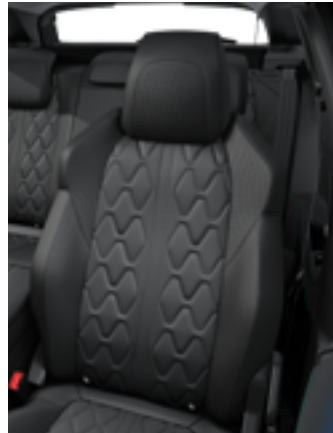
Mistral Nappa leather trim