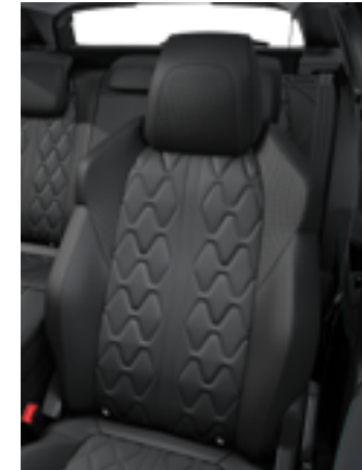
Nappa Mistral full grain leather trim