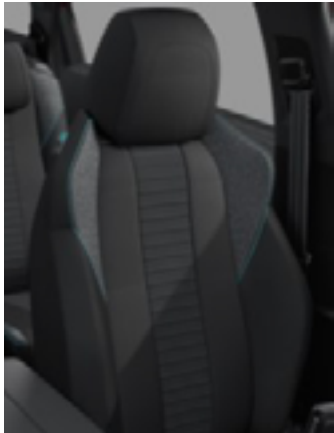
Mistral 'Pneuma' fabric trim