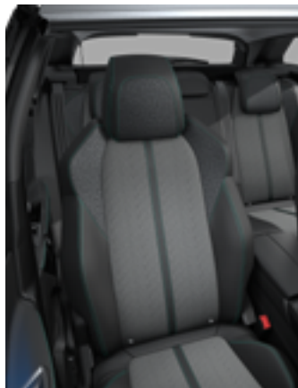
Half Leather effect trim with Mistral 'Colyn' cloth seat trim