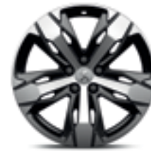
18" 'Detroit' Storm Grey Standard on ACTIVE & ALLURE