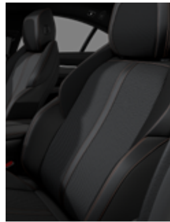
Mistral tri-material 'Belomka' leather effect and 'Ornis' cloth