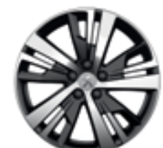
18" 'Los Angeles' with Advanced Grip Control