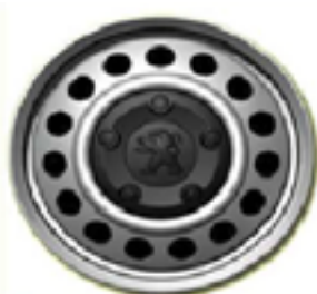
16" steel wheel with black centre cap