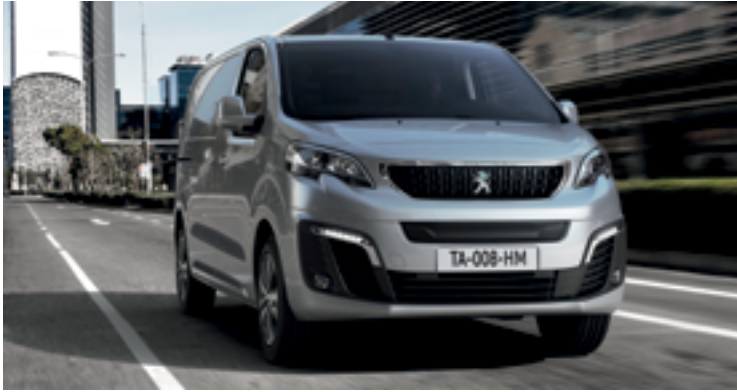
PEUGEOT e-Expert Front View